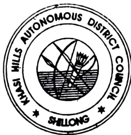
Member Secretary Khasi Hills Building and Structure Regulatory Authority (KHBSRA), Khasi Hills Autonomous District Council, Shillong.

With reference to your application mentioned above, I am directed to inform you that the Authority do hereby grant you No objection Certificate (NOC) for availing the services of electricity and water supply connection from MeECL/PHE for your building located at Maulai Mawkyntroh Umshing .